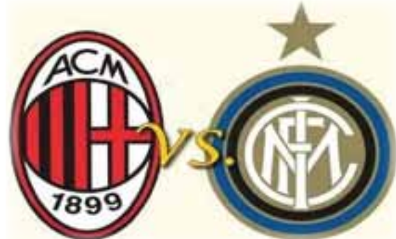
Football at San Siro