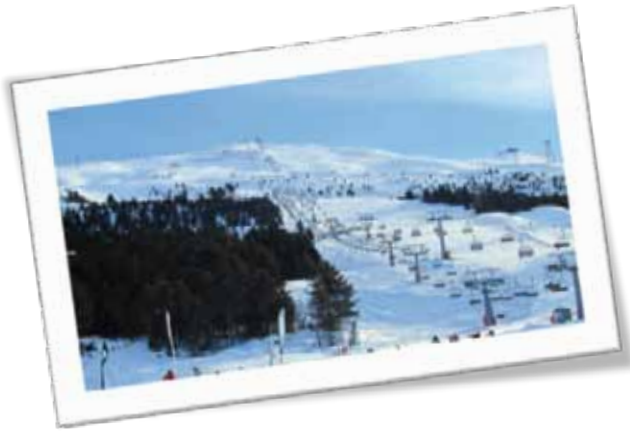
View of Bormio piste at 2000m