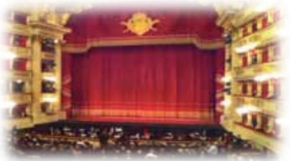
La Scala Theatre