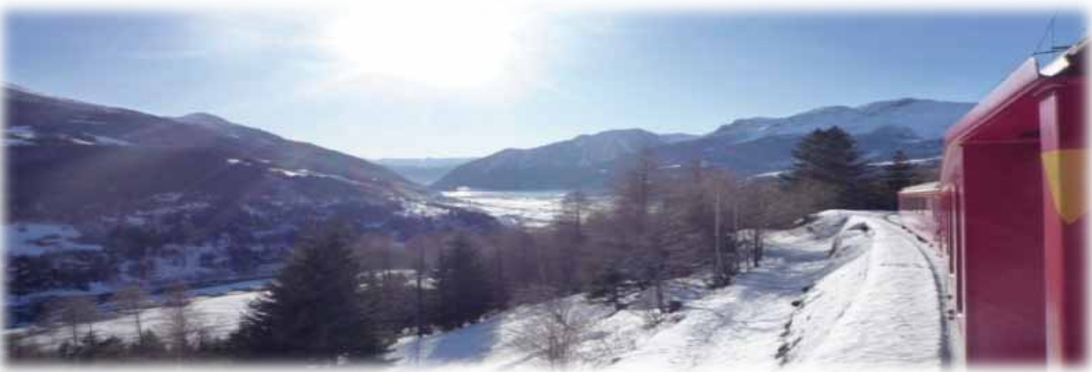
View from the Bernina Express Red train

Australian European Symposium Pty Ltd National Australian Bank Account number : 942040241 BSB : 082057